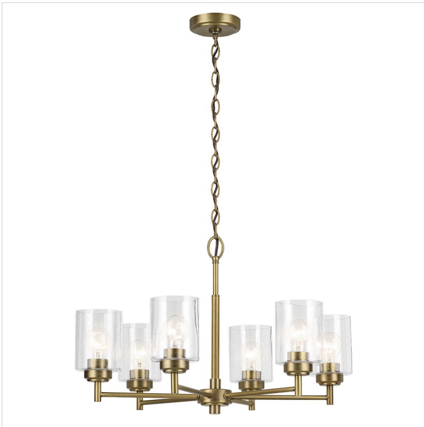
KL-WINSLOW6-NBR Winslow 6 Lt Chandelier - Natural Brass