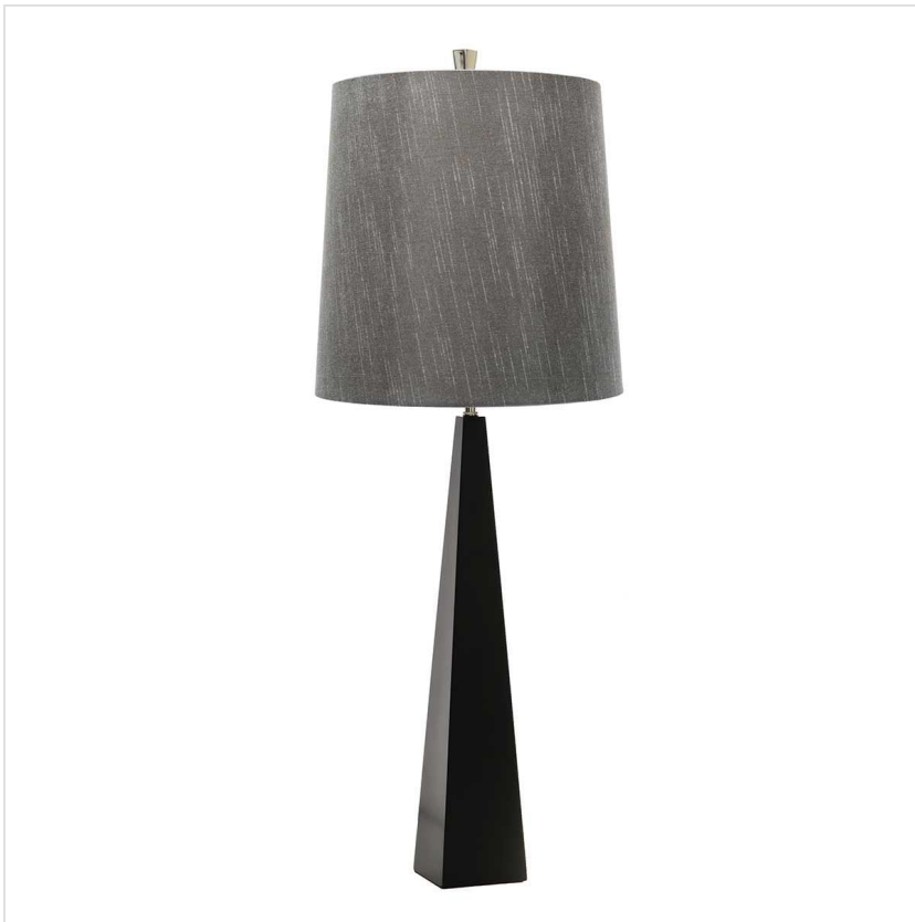
ASCENT-TL-BLK Ascent 1 Light Table Lamp with Dark Grey Shade - Black