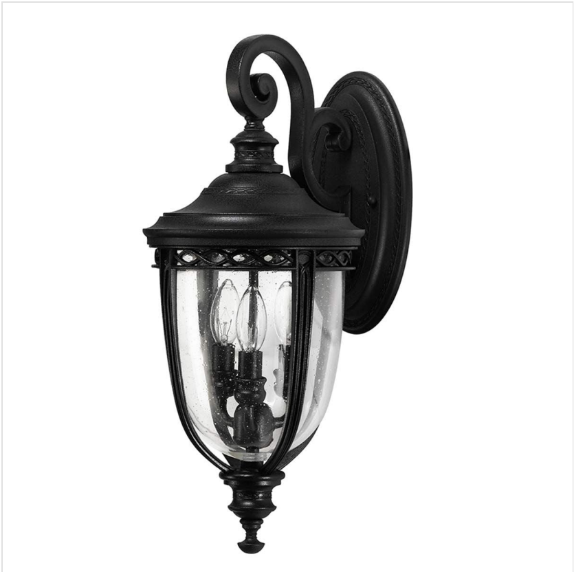
FE-EB2-M-BLK English Bridle 3 Light Medium Wall Lantern - Black