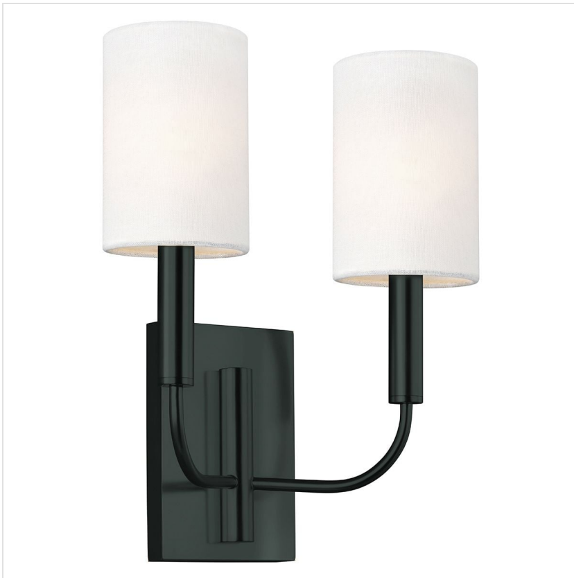
FE-BRIANNA2-BK Brianna 2 Light Wall Light