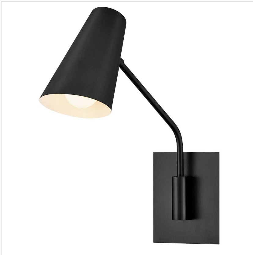
HK-BRAY-1WB-BK Bray 1 Light Wall Light