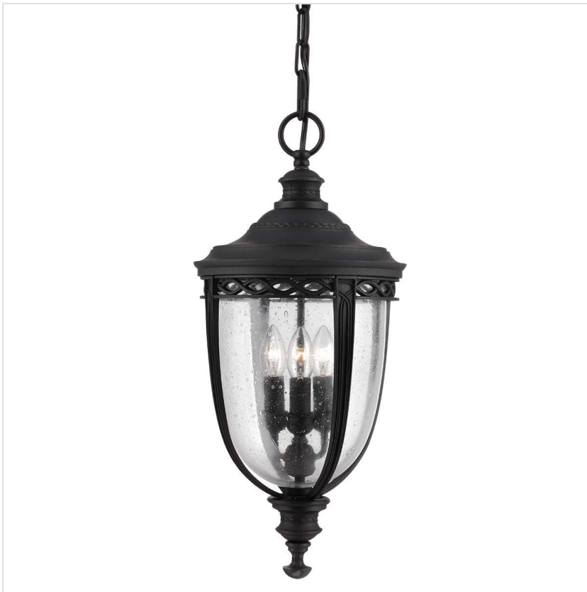
FE-EB8-L-BLK English Bridle 3 Light Large Chain Lantern - Black