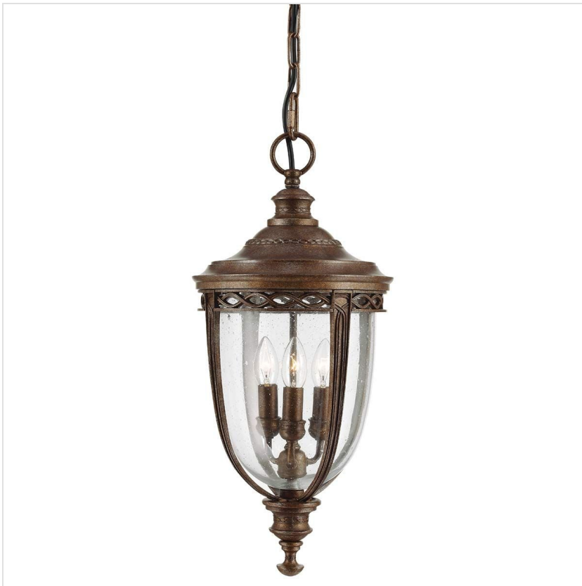
FE-EB8-L-BRB English Bridle 3 Light Large Chain Lantern - British Bronze