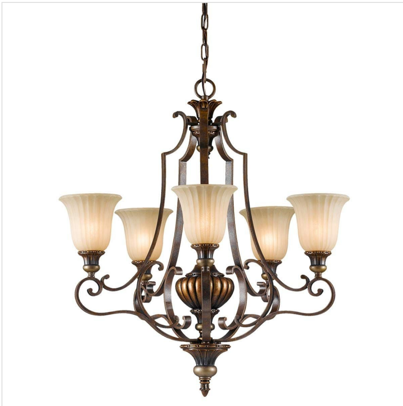
FE-KELHAM-HALL5-UPLT Kelham Hall 5 Light Up Light Chandelier - Firenze Gold / British Bronze