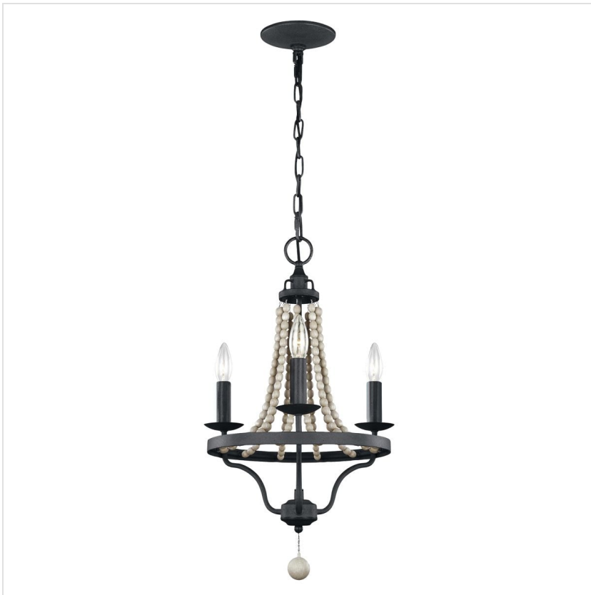
FE-NORI3-DWZ Nori 3 Light Chandelier - Dark Weathered Zinc with Driftwood Grey