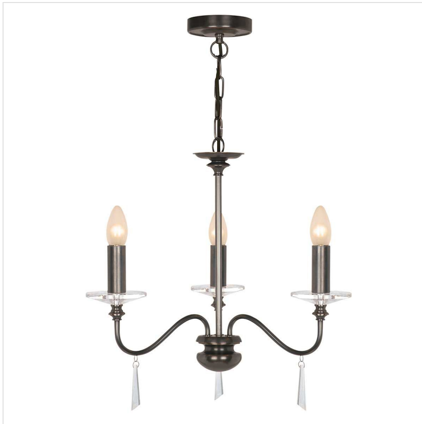
FP3-OLD-BRZ Finsbury Park 3 Light Chandelier - Old Bronze