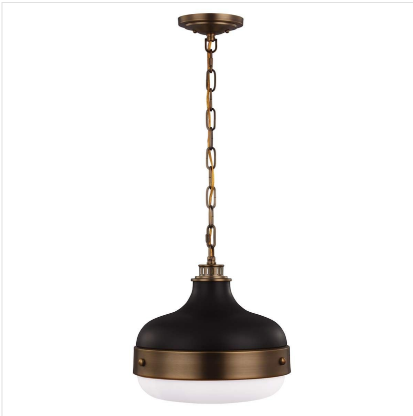
FE-CADENCE-2P-MB Cadence 2 Light Pendant - Dark Antique Brass / Matte Black