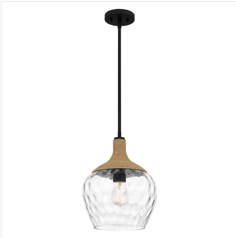
QZ-ROYER-1P-MBK Royer 1 Lt Pendant - Matte Black with natural rope detail and clear mottled blown glass shade