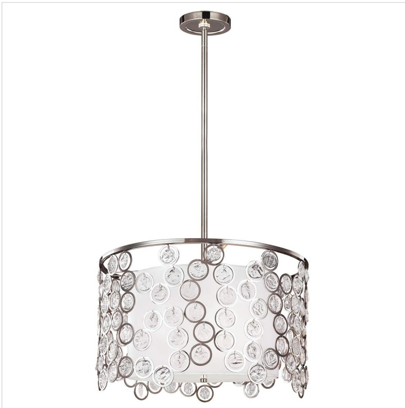
FE-LEXI-P Lexi 3 Light Pendant - Polished Nickel